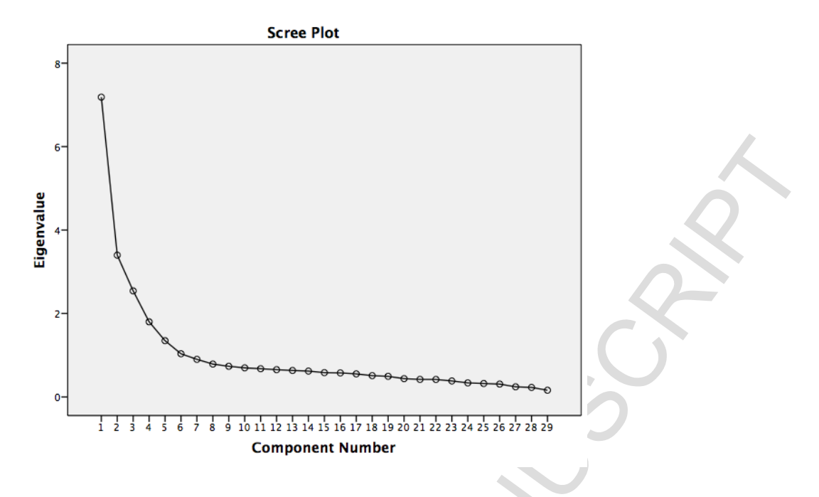
Figure 1. Screen plot graphic (eigenvalues according to the factors).